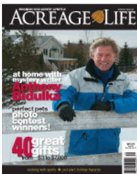
how to get a copy